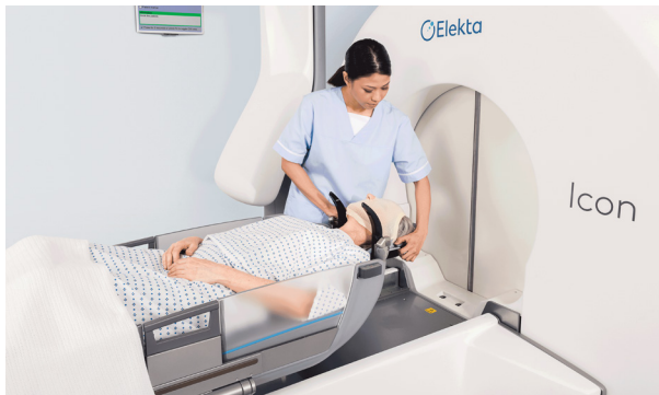
Patient undergoing SRS treatment with Gamma Knife®.

SRS is becoming the preferred treatment for patients with a limited number of brain metastases. 18 Patients with brain metastases are increasingly being treated with SRS as studies show it is associated with less cognitive decline than WBRT with no difference in survival. 18,24 However, intensity-modulated radiation therapy and memantine, two more recent developments, also have been shown to lead to less cognitive decline. 22,23